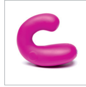
G-Kii Fuchsia 5060170970553