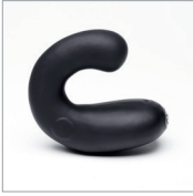
G-Kii Black 5060170970584