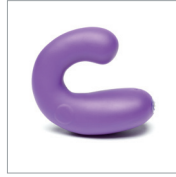
G-Kii Purple 5060170970577